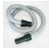
Standard treatment hose