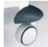
Wheel with brake

Zimmer Elektromedizin GmbH Junkersstraße 9 D-89231 Neu-Ulm Tel. +49. (0)7 31. 97 61-291 Fax +49. (0)7 31. 97 61-299 export@zimmer.de www.zimmer.de